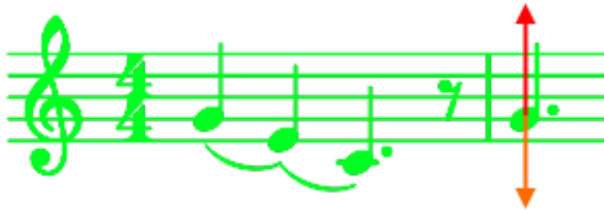
Figure 3: Arpeggio for fields on the left (negative x -angles). The melody moves downwards. The tempo is a function of the x -angle. The pitch of the last note is a function of the y -angle.

The y -angle manipulates the pitch continuously, so you may hear changes while the note is being played. Such a strategy has been referred to as scalable earcon [6].