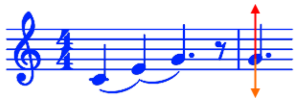
Figure 2: Arpeggio for fields on the right (positive x -angles). The melody moves upwards. The tempo is a function of the x -angle. The pitch of the last note is a function of the y -angle.

When y is 0, the fifth is played once more. For positive y -values, the pitch goes up (red arrow). For negative values, it goes down (orange arrow). You only need to compare the last two notes to understand whether you have to tilt the phone towards or away from you.